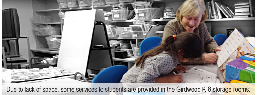
Due to lack of space, some services to students are provided in the Girdwood K-8 storage rooms.