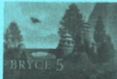
Create your own digital world.