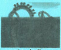
Ride on a virtual roller coaster that YOU design and build!

Camp Internet: Extreme is Alaska's longest running premiere technology camp. We have been featured on KTUU and the Anchorage Daily News multiple times. Camp Internet: Extreme , entering its 17th awe-inspiring year, offers students access to top-of-the-line 20" flat screen iMac computers, a wide variety of cutting edge multimedia equipment, and two certified teachers with 29 years of combined technology teaching experience. Design bridges, morph your friend, create your own digital World, produce stop motion animation , design and ride a roller coaster , animated digital creatures , produce your own digital music , make a digital photo mosaic of your face and much, much, more! Camp Internet: Extreme is not only educational , it's a blast! Make Camp Internet: Extreme a part of your summer fun. Recommended age, 2nd through 10th grade.