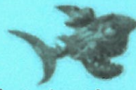
Create animated characters.