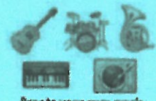
Create your own music.

http://www.asdk12.org/staff/weimann_doug/pages/Camp_Internet_Extreme/